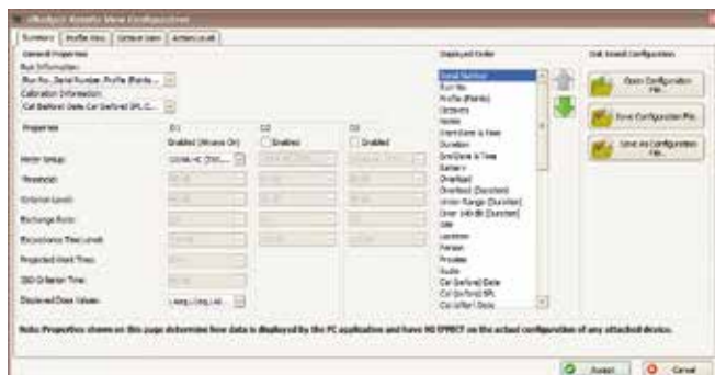
Configuration screen showing set ups for D1, D2 & D3