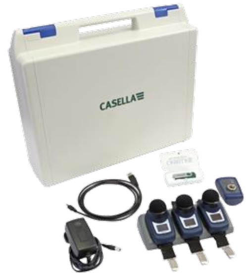
A typical measurement kit

Additional dBadges may then be purchased as required (and additional extension Docking Stations). For more information please see 'Ordering Information' below.