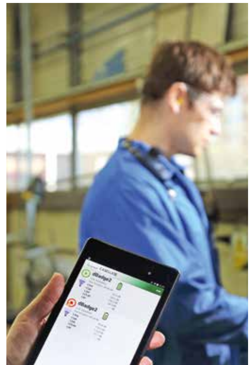
Monitor multiple devices at once