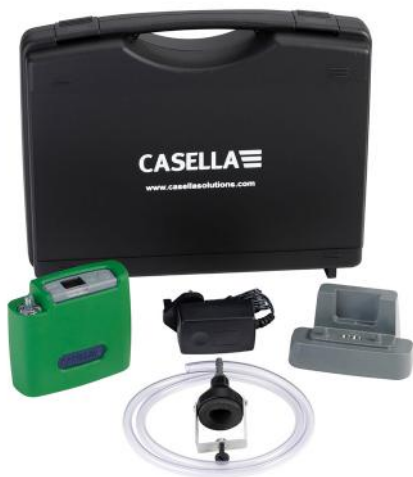
The Flow Detective™ is available as a kit with a sturdy carry case