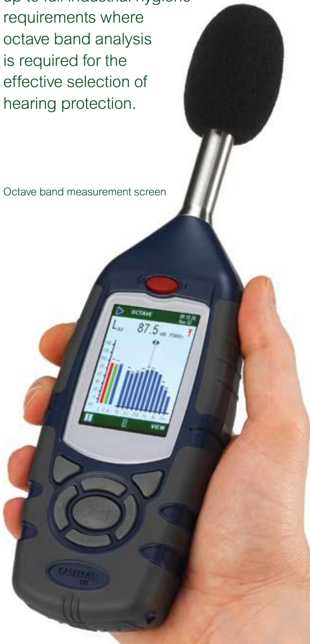
Octave band measurement screen

Different models are available depending on your requirements for use in general workplace noise measurements, up to full industrial hygiene requirements where octave band analysis is required for the effective selection of hearing protection.