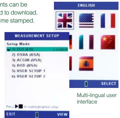
Multi-lingual user interface

When connected to a PC via the USB connection, the CEL-600 series acts like a memory card, so data files can be moved to a PC and easily reviewed without the need for proprietary software.